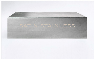
SATIN NO PATINA, BURNISHED