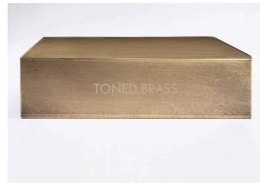
TONED BRASS BLENDED PATINA, LIGHT VALUE - GOLD, CRIMSON BLUSH, RAW UMBER