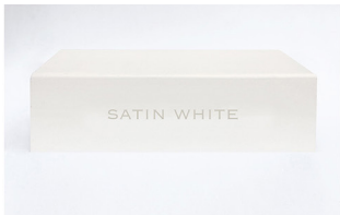
SATIN WHITE WAXY NEUTRAL OPAQUE