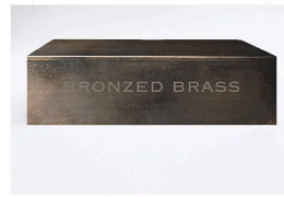
BRONZED BRASS SOLID PATINA, DARK VALUE - BLACK, UMBER, MUTED GOLD, HINTS OF COPPER AND BLUE-VIOLET