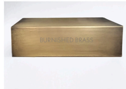
BURNISHED BRASS BLENDED PATINA, LIGHT VALUE - YELLOW-GOLD, RAW UMBER